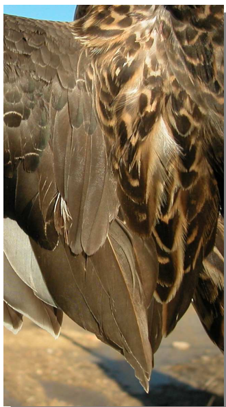
Gadwall. Adult. Female: pattern of tertials (02-II).