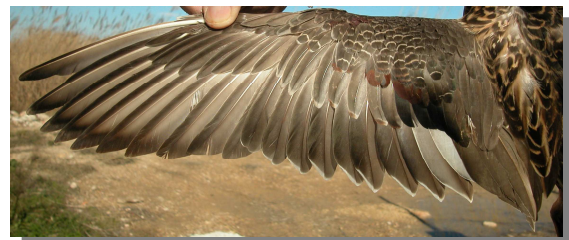
Gadwall. Adult. Female: pattern of wing (02-II).