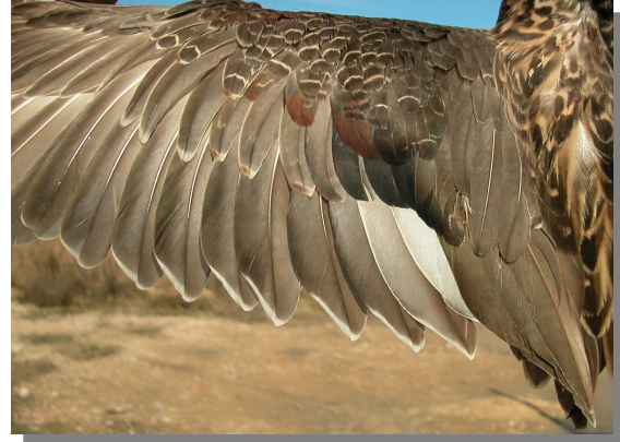
Gadwall. Adult. Female: pattern of secondaries (02-II).