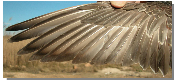
Gadwall. Adult. Female: pattern of primaries (02-II).