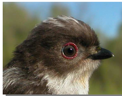
Long-tailed Tit. Head pattern: top adult (15-V); bottom juvenile (15-V).