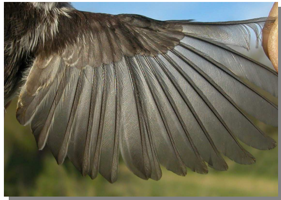
Long-tailed Tit. Juvenile: pattern of wing (15-V)