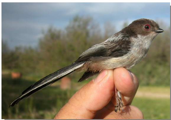
Long-tailed Tit. Juvenile (15-V).