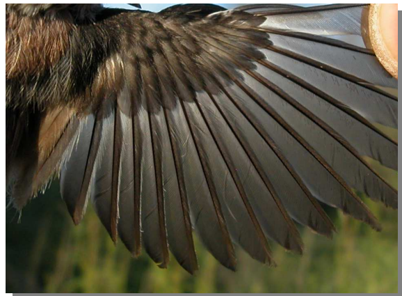
Long-tailed Tit. Adult: pattern of wing (15-V).