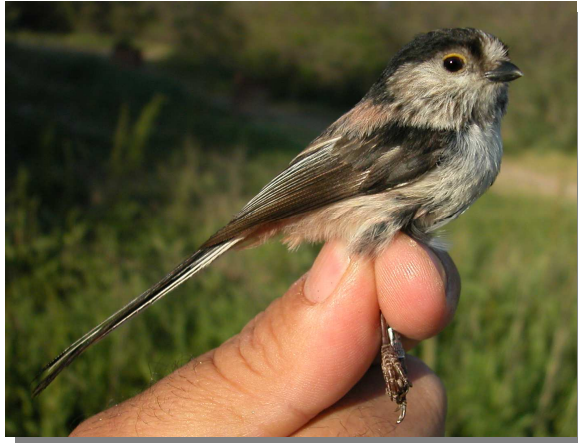
Long-tailed Tit. Adult (15-V).