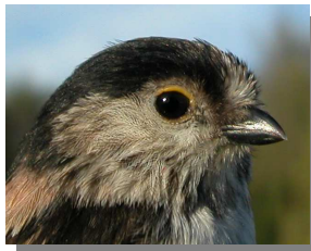
Long-tailed Tit. Pattern of head and upperparts.

13-15 (of which tail 7-9). Small species with long black and white tail; black and vinous upperparts; light underparts with reddish belly.