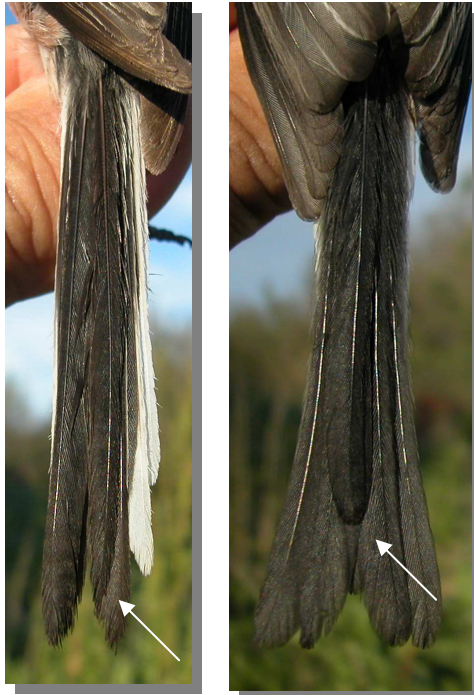
Long-tailed Tit. Ageing. Pattern of the central tail feather: left adult; right juvenile.