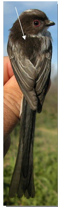
Long-tailed Tit. Ageing. Pattern of upperparts: left adult; right juvenile.