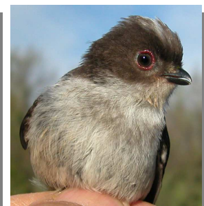
Long-tailed Tit. Breast pattern: left adult (15-V); right juvenile (15-V).